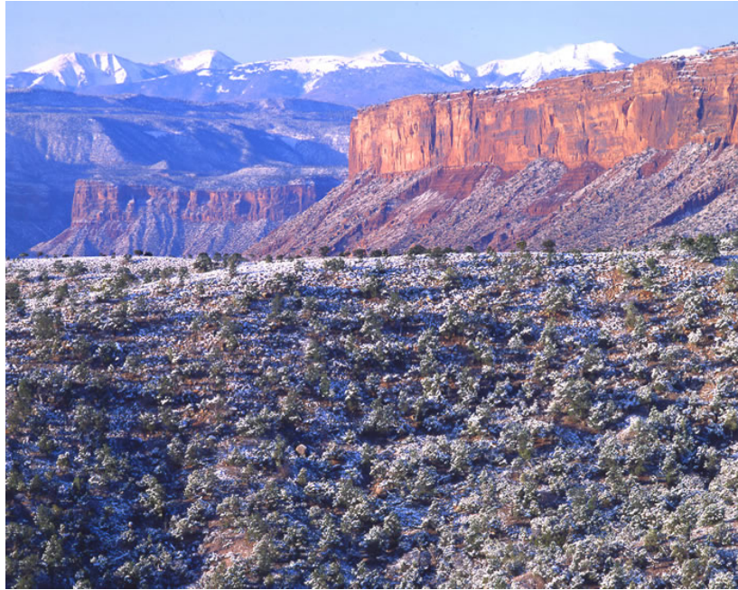
The Palisade

plains, making this the ideal location for hikers, climbers, and explorers. The region includes both desert and mountainous areas, including Ponderosa and Juniper forests. The valley area is shadowed by commanding red cliffs that tower above, exemplifying the beauty of sedimentary rock.