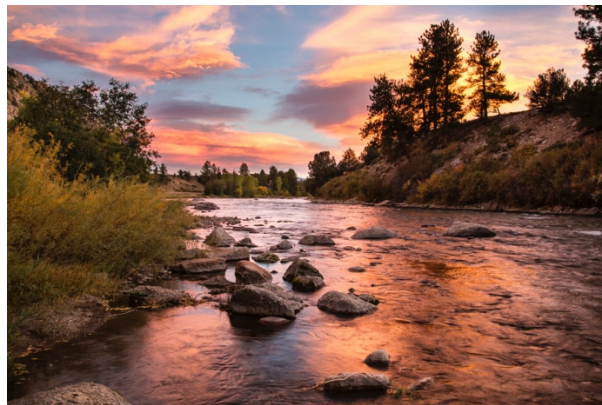
Browns Canyon

Browns Canyon, in addition to being a popular location for recreational activities such as hiking, fishing, and rafting, is also important for paleo-climatological research. Due to changes in the climate and other events, a variety of endemic plant life such as, Brandegee's buckwheat, Fendler's Townsend-daisy, Fendler's cloak-fern, Livermore fiddle-leaf, and Front Range alumroot. Additionally, the area is rich with animal species of all varieties including raptors like peregrine falcons, prairie falcons, and golden eagles, as well as mammals such as mountain lions, bighorn sheep, elk, mule deer, bobcat, red and gray fox, black bear coyote, and several others.