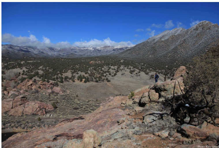
Table Mountain

Together with McIntyre Hills to the south, Table Mountain comprises one of the steepest Arkansas River canyons. Table Mountain acts as a wildlife corridor along the Arkansas River and to other regions to its north, and it also serves as the home and nesting ground to a variety of raptors, including bald eagles in the winter. There is also a broad array of habitat in the area of Table Mountain including arid shrubland, woodlands, and meadows. This allows a variety of animal life to inhabit the area including the aforementioned raptors, as well as bighorn sheep, mountain lion, coyote, elk, deer, rattlesnake, among others. The area also offers opportunities for recreational activities such as hiking, horseback riding, and rock climbing.