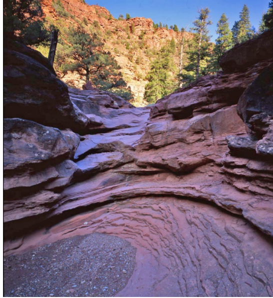
Bull Gulch