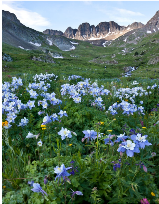
Handies Peak

bighorn sheep. Animals are not the only ones who flock to Handies, as adventures come from all over to revel in and enjoy the beauty of this Colorado wonder.