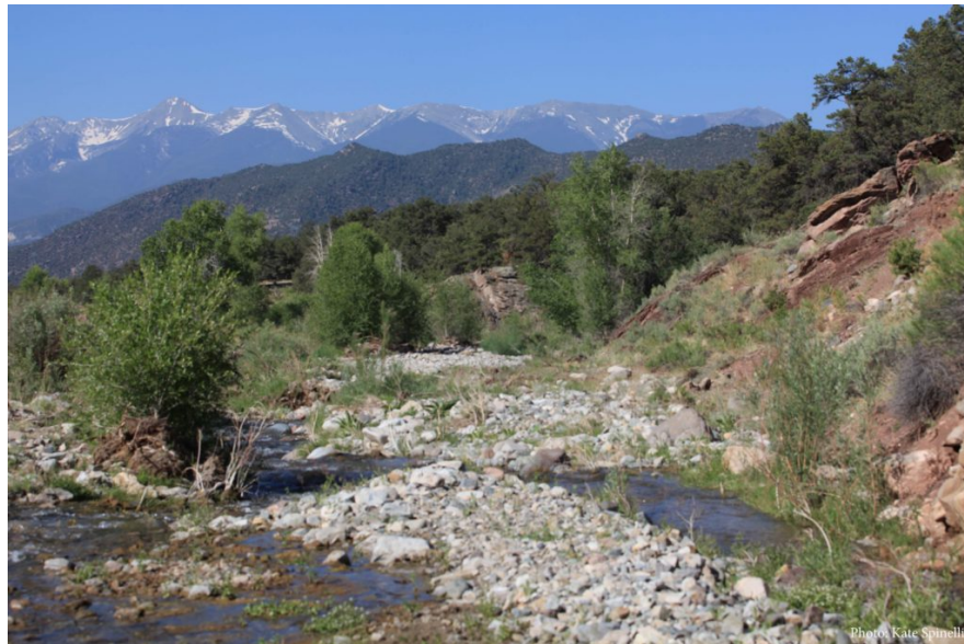
Badger Creek

Badger Creek is perhaps most notable because of the lack of human impact. The people who do make it to Badger Creek find a pristine habitat for bighorn sheep, black bears, mountain lions, and a litany of other species that live in the shadows of the Sangre de Cristo range. The area also serves as winter forage and winter range for the bald eagle. In addition, as one of very few spring-fed waterways in Colorado, Badger Creek provides consistent moisture to the ecosystem and supports a healthy population of trout and a happy population of fishermen.